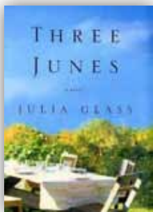
Adult book discussions on 2nd Mondays at 11 a.m.